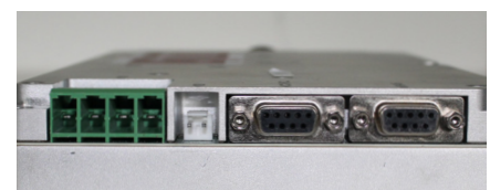
Power Supply and Control Connections